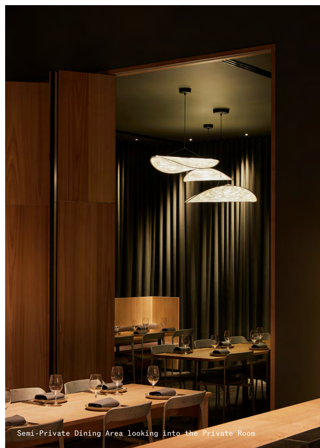
Semi-Private Dining Area looking into the Private Room